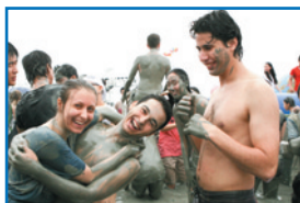
[Field trip - DMZ & Mud Festival]